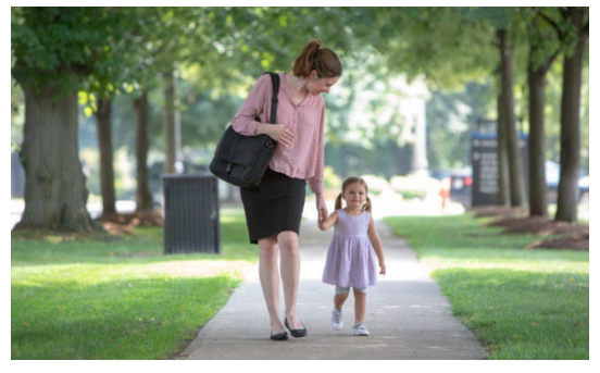
Moms are Leaders