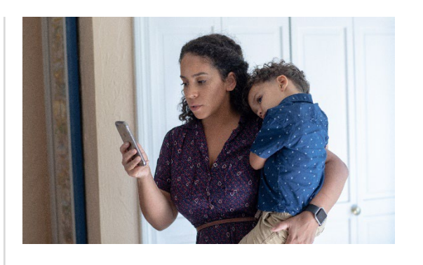
Moms and Confidence